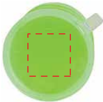
LOCATION 1: TOP